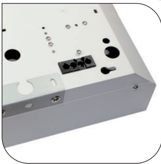
Rear of Oregon with connector fitted