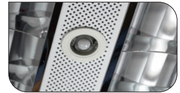
Indiana is available with PIR sensor fitted