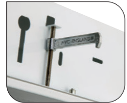
Supplied complete with side-arm support brackets