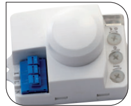
Available with micro-wave occupancy sensor fitted internally